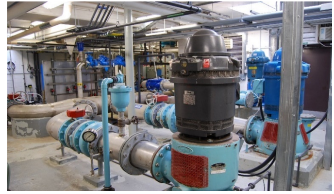
Pour plus de renseignements sur l'eau potable en Ontario, consultez le site www.ontario.ca/eaupotable

De nombreux documents utiles peuvent vous aider à exploiter votre réseau d'eau potable. Vous trouverez ci-après une liste de documents que les propriétaires et exploitants de réseaux résidentiels municipaux d'eau potable utilisent fréquemment. Pour accéder à ces documents en ligne, cliquez sur leur titre dans le tableau cidessous ou faites une recherche à l'aide de votre navigateur Web. Communiquez avec le ministère au 1-866-793-2588, ou encore à waterforms@ontario.ca si vous avez des questions ou besoin d'aide.