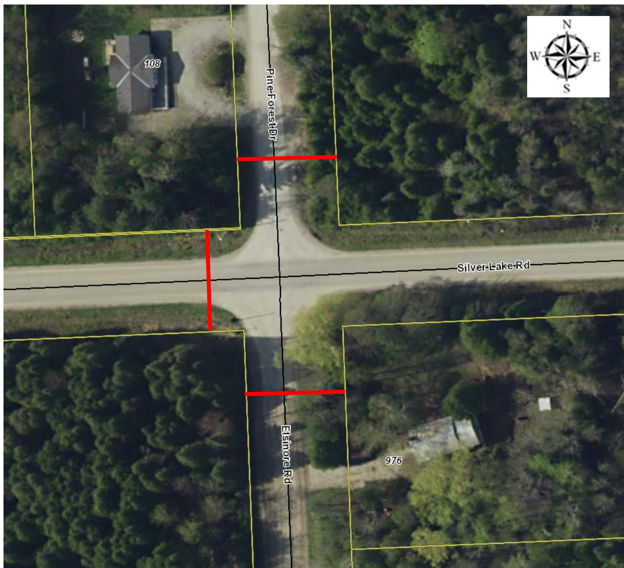
Figure 1: Intersection of Silver Lake Road, Pine Forest Drive and Elsinore Road

Limits of Construction and Intersection Details for pulverizing, granular 'A' and Asphalt Placement